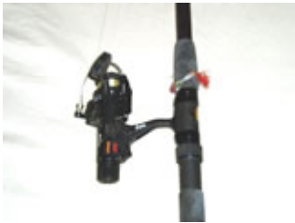
Caña de Pescar