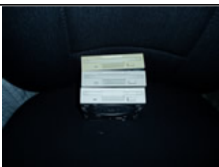
3 Unidades de Diskettes.