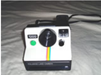
Para coleccionistas, camara instantanea Polaroid.