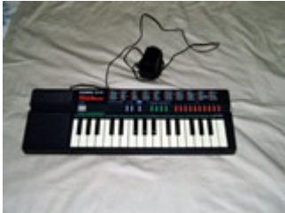
Mini sintetizador Casio.