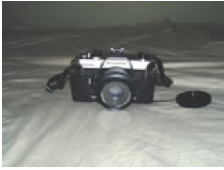
Camara Fotografica Profesional Fujifilm