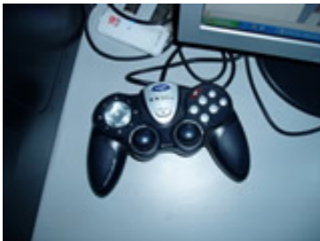
Control USB Para Juegos PC, marca Saitek.