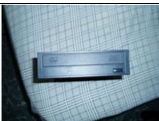
Lector de CD y DVD. Marca Hitachi.