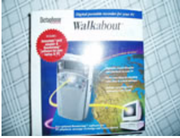
Grabadora Digital de periodista. Tarjeta PCMCIA.