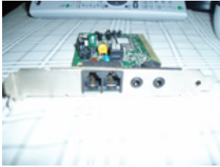
MODEM PCI Interno de 56 Kbps.