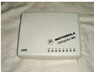
Modem Motorola 28 Kbps en excelente estado.